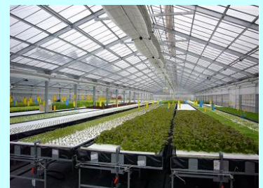
Fig. 2. Photo at Plant Factory